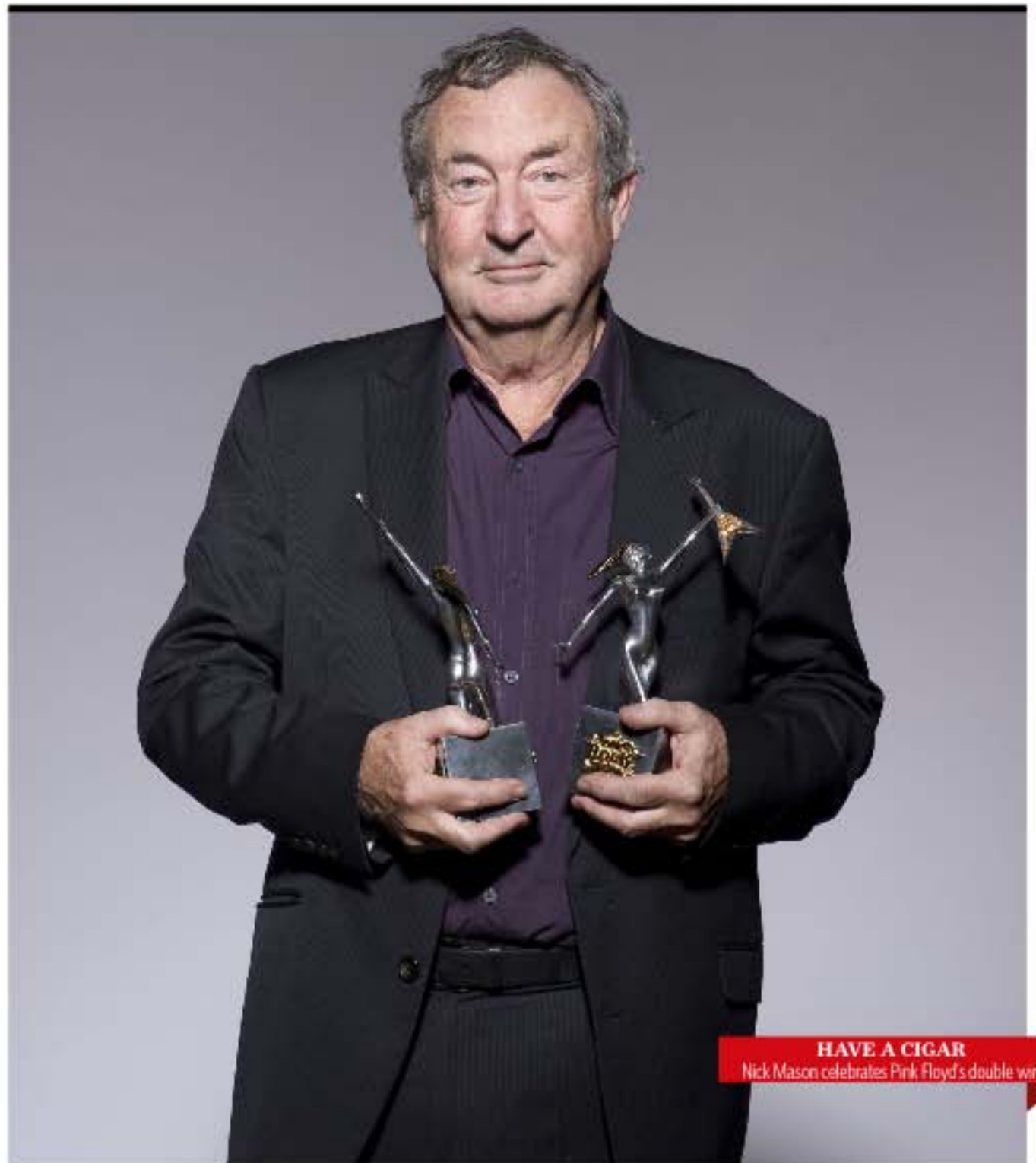
HAVE A CIGAR Nick Mason celebrates Pink Floyd's double win

“What Roger wrote when he was 23 is as relevant to a 50 year old as it is to a kid.”